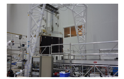
Page 1/1 ESA Standard Document Date 6 July 2018